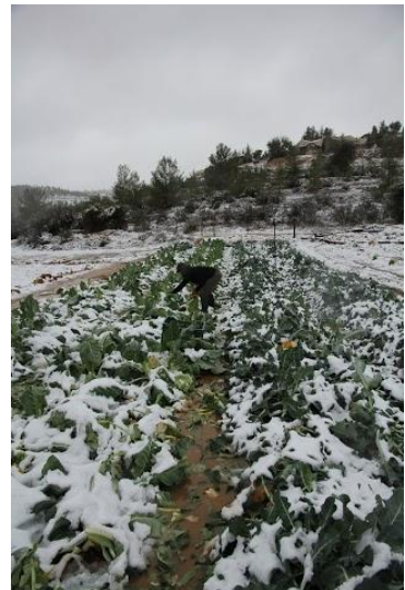
What happened to our crops?