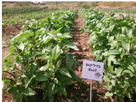
A salad in the making...