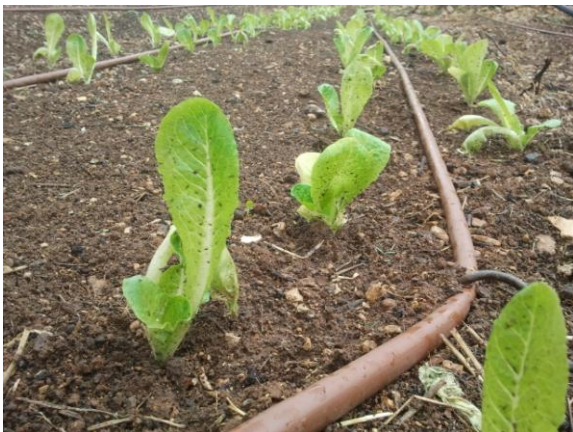
How exciting - signs of life begin to appear!