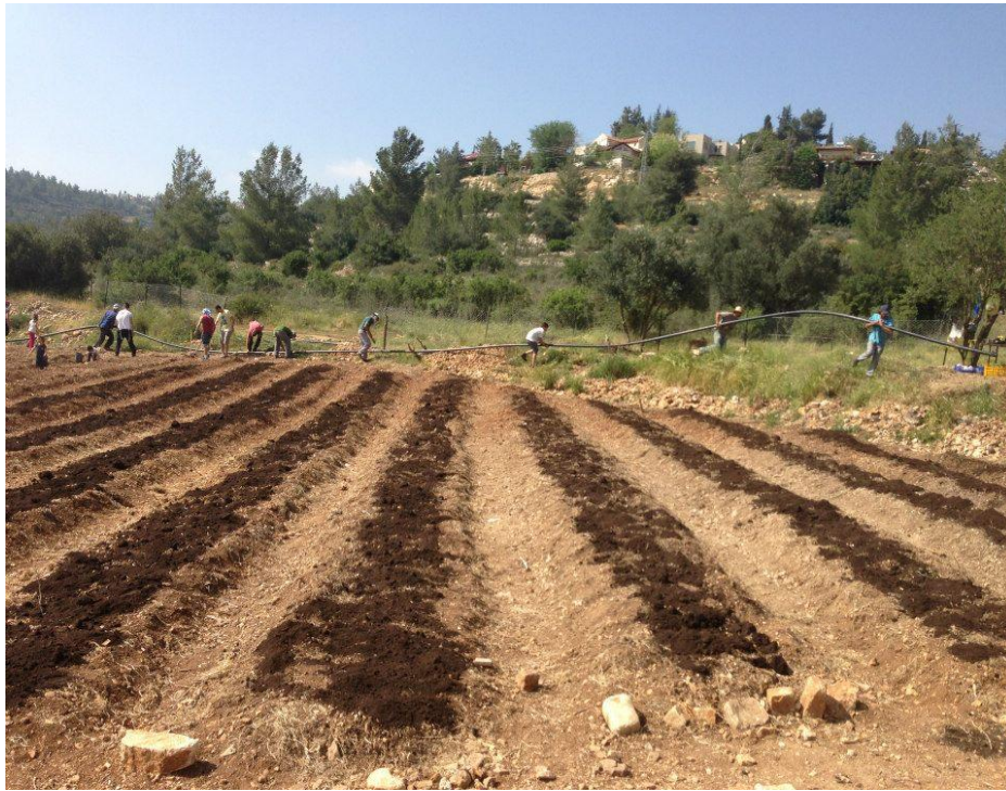
Installing the main water pipe, a donation by Netafim. Planting begins within days.