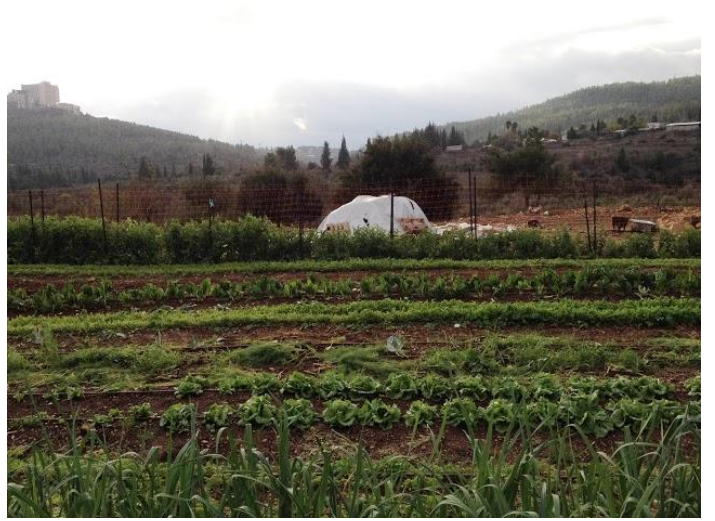
Preparing for Thursday packing and deliveries. It seemed like business as usual, but wait...