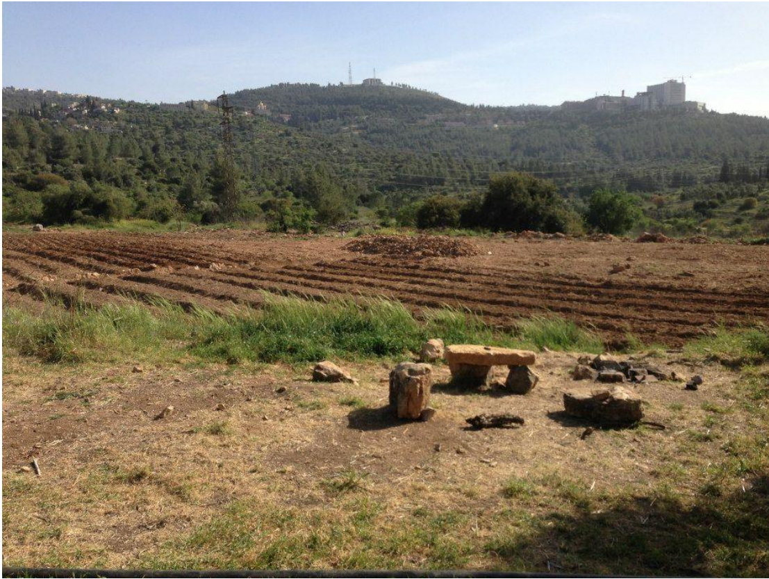
After clearing tons of boulders and debris the land is ready for the first planting season