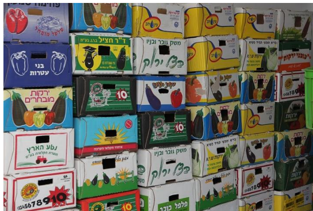
The end is in sight!