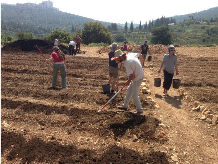
Adding the compost to the land