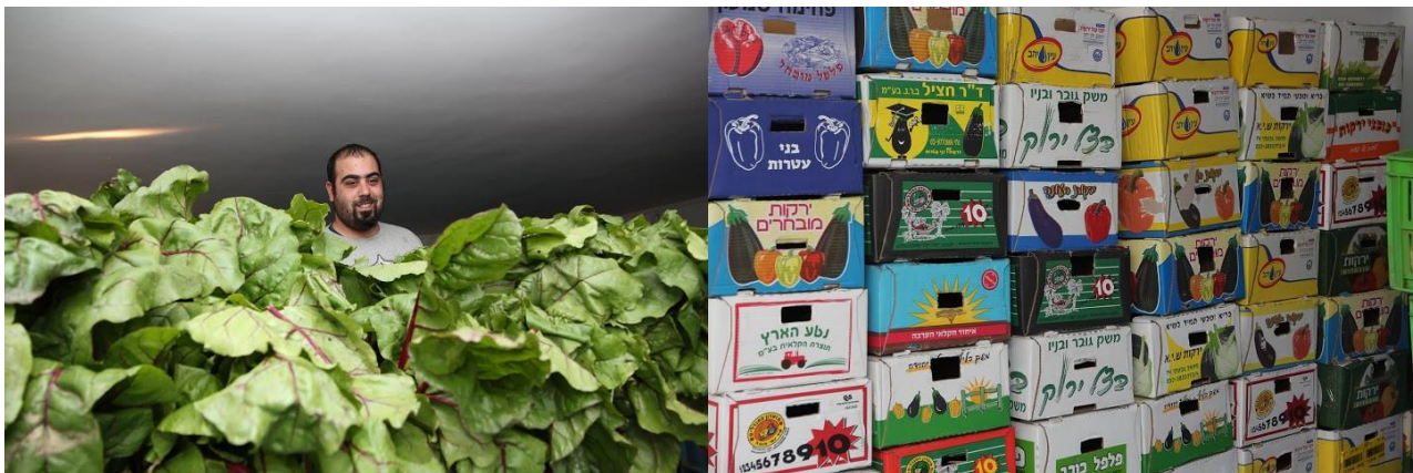
The end is in sight!