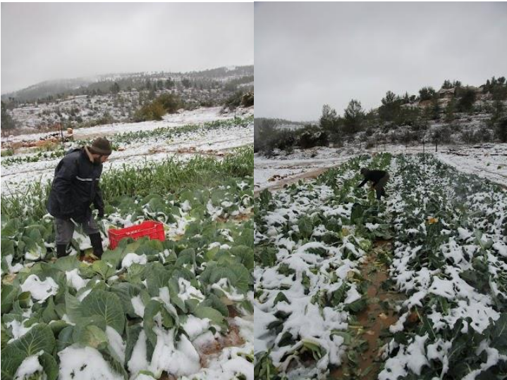
What happened to our crops?