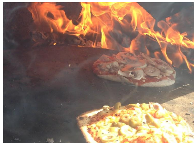
Pizza is our reward