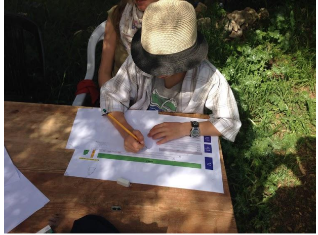
Hard at work